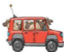
sheep in a jeep

Pronunciation Phrase - ai Open your mouth wide and say ai ai ai