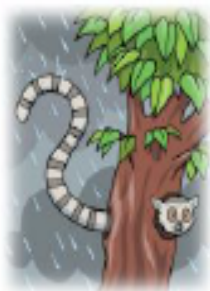
tail in the rain