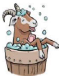
soap that goat

Pronunciation Phrase - igh Open your mouth wide in a relaxed way and say igh igh igh