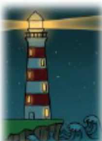
a light in the night

Pronunciation Phrase - ee Smile with your lips apart and say ee ee ee